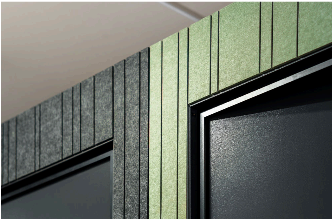
X-frame Grooves. (Photographed by David Hensel. X-frame Booster XL, 2024)